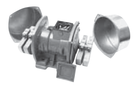
RE Vibrator Largest variety of frequencies

Call our Customer Service Department direct at 1-800-879-AJAX (2529) Ext.248, for complete details